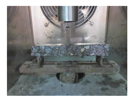
Fig3.1 the beam loading

mixture, diatomite modified asphal mixture, PE and diatomite composite modified asphalt mixture, then respectively forming rutting plate; When the rutting plates reaching health stipulated time, according to the test specification, the rutting plates will be cut into little beams which could satisfy regulation size (there kinds of asphalt mixture cut into three groups of little beams, respectively label with 1, 2, 3); Finally putting the beams on the experiment