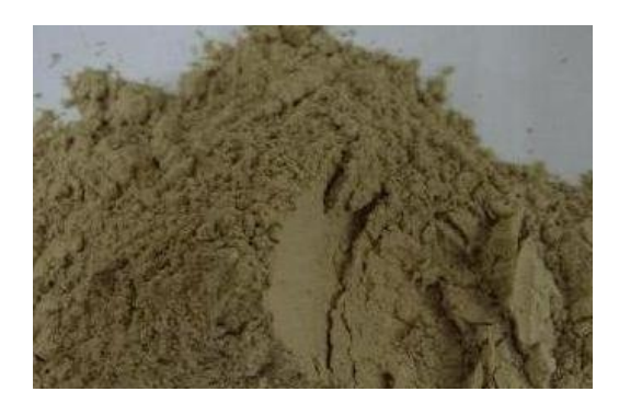
Fig2.2 the modifier of diatomite

Aiming at evaluate the performance of the asphalt mixture low temperature stability, according to the highway engineering asphalt and asphalt mixture experiment rules "(JTG E20-2011), low temperature bending test is adopted to judge the asphalt mixture' ability to resist low temperature crack . The experiment request forming asphalt mixture rutting plates and then using cutting machine to cut the plates into little beams; Through