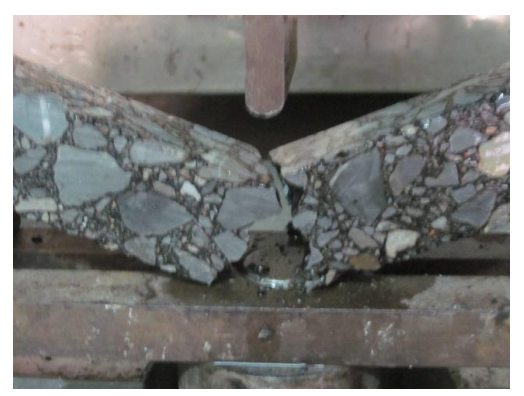
Fig3.2 the beam broke

machine, adjust the machine to the specified test temperature and after reaching a certain time. With three-point loading experiments, we record the maximum tensile strain , maximum tensile stress as well as the largest strain energy of the beams when the beams got broke .loading and broke figure of beam are show on figure 3.1 and figure 3.2.Mixture ratio used AC-25 and its ratio shows in table3.2.